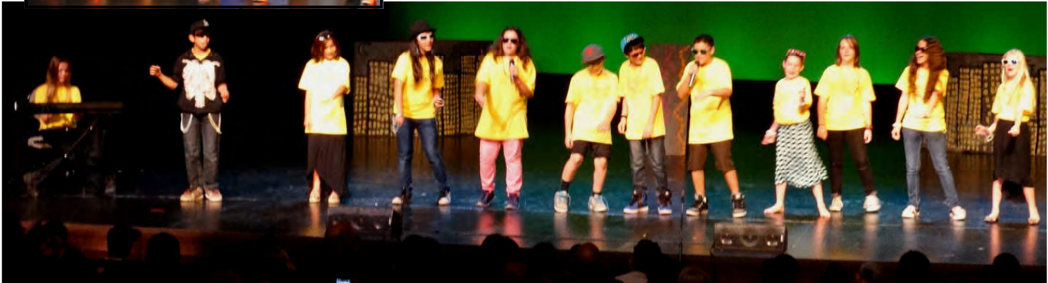
K(Arts) Fall Grand Finale—Nov. 20, 2013 Kahilu Theatre