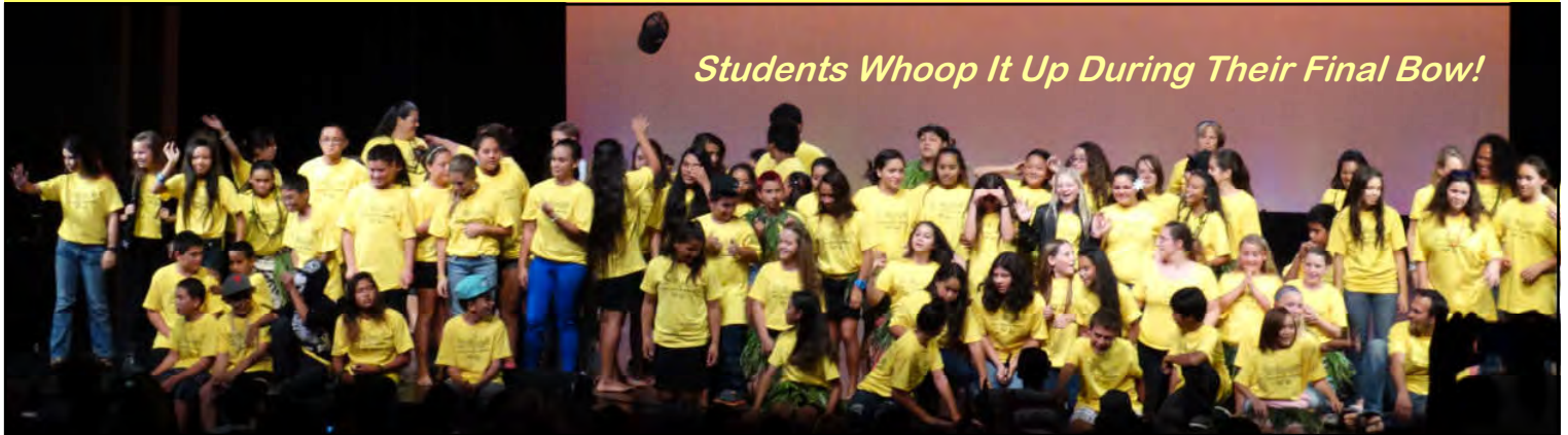
Students Whoop It Up During Their Final Bow!