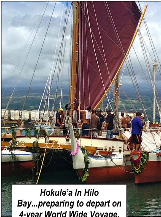
Hokule'a In Hilo Bay...preparing to depart on 4-year World Wide Voyage.