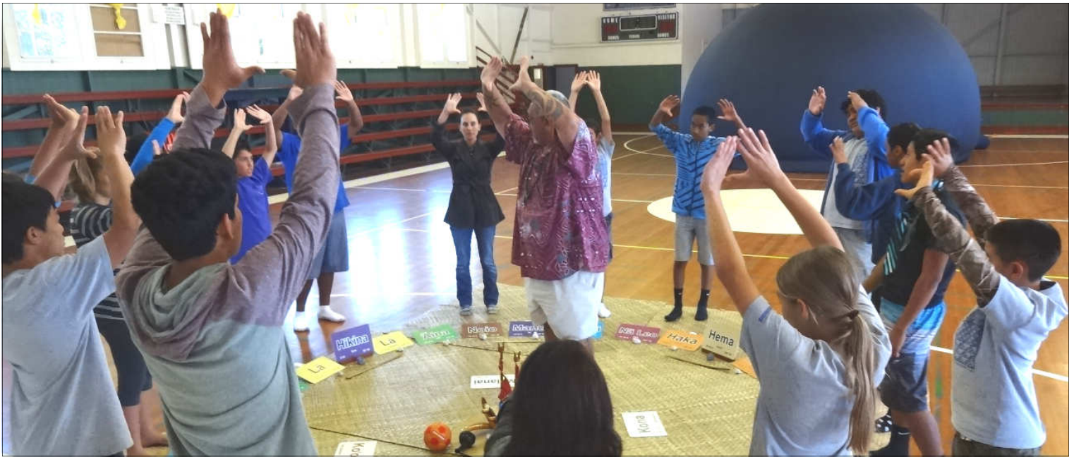
Navigators Share Insight On How To Commit Star Compass to Memory...